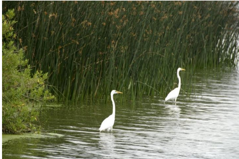
Armand Bayou Nature Center