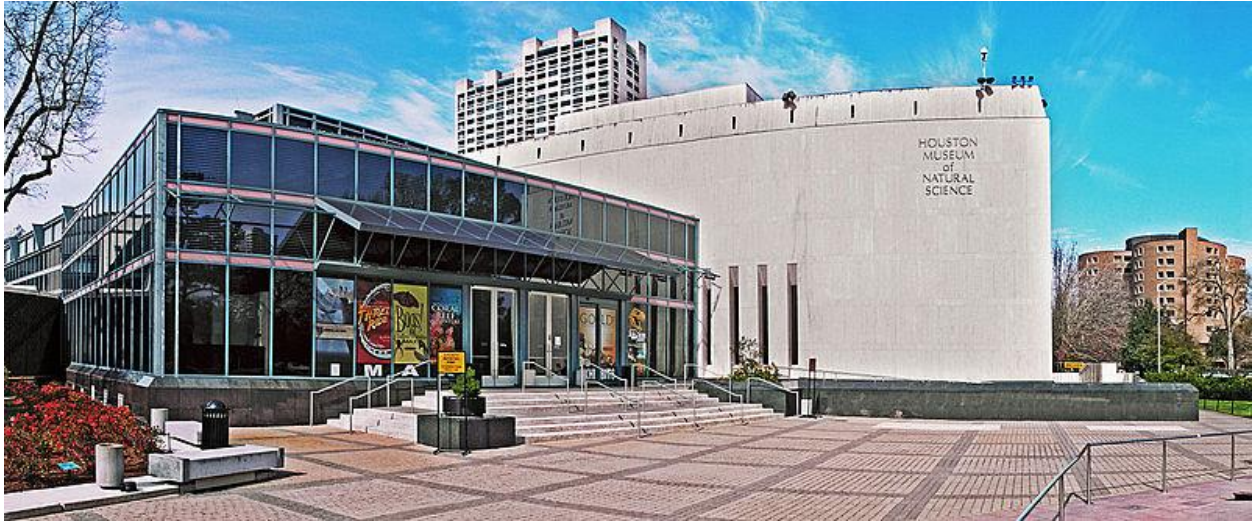
Houston Museum of Natural Science

10:00 a.m. Bus Departs for Field Trip to Houston Museum of Natural Science (For Members and Significant Others). We decided that a late start might be a good idea!