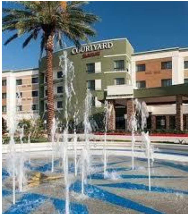
Courtyard Marriott Houston NASA /Clear Lake