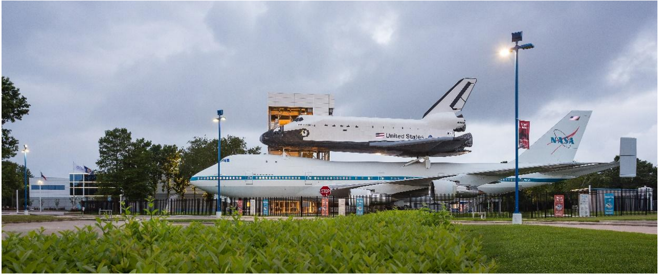
Space Center Houston

8:30 a.m. Enter Houston Space Center through Main Entrance