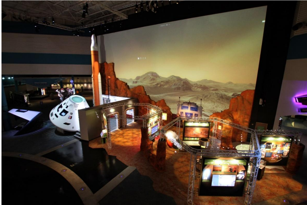
Mission Mars Exhibit