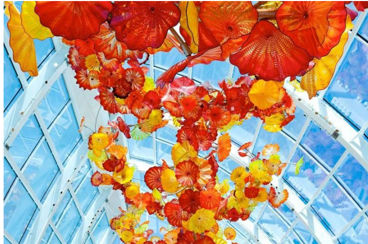
Glasshouse sculpture, Chihuly Garden and Glass