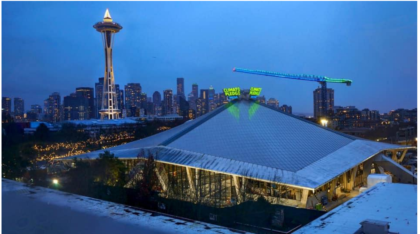
Climate Pledge Arena

Climate Pledge Arena aims to be the most progressive, responsible, and sustainable arena in the world. The technology and engineering involved are amazing. The host committee has arranged a special insider tour of the arena that is tailored to the interests of ASMD participants.