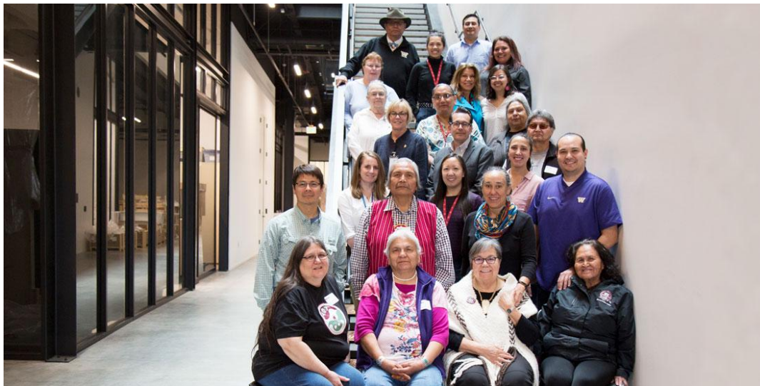
Burke Native American Advisory Board Members and Burke Museum Staff

12:00 p.m. Lunch and Program in the Cascade Room—Catered by Off The Rez Café