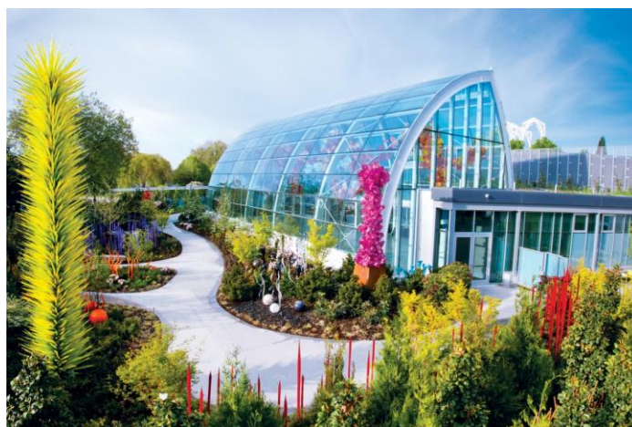
Chihuly Garden and Glass

Chihuly Garden and Glass is located in the Seattle Center next to the Space Needle. They are sister private entities, managed as a single business. Chihuly Garden and Glass features the glass studio art of Dale Chihuly and the beauty of glass architecture and gardens. It is interesting to experience the beauty of glass in the Chihuly Garden along with the design and re-engineering of the Space Needle using glass. During this visit, you will have an opportunity to learn more about operation strategies during the pandemic and the recent renovation of Chihuly Garden and Glass and the Space Needle.