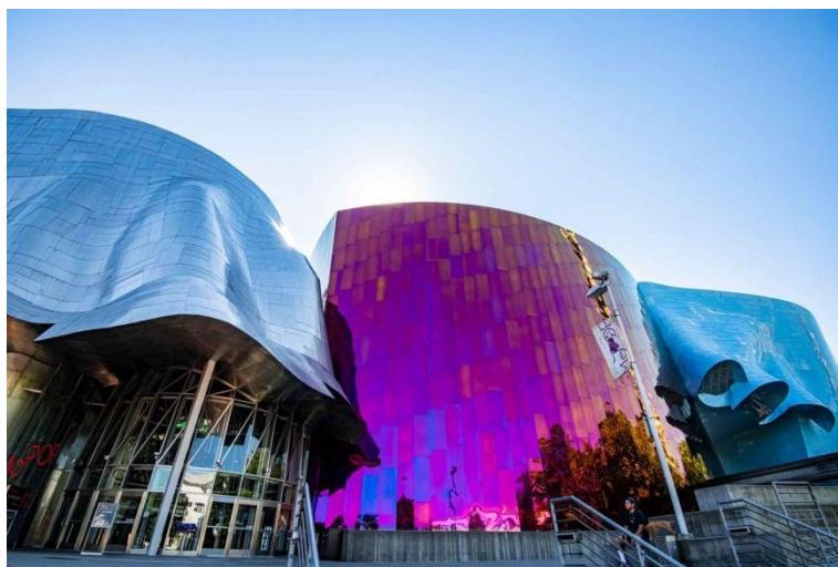
The Museum of Pop Culture (Frank D. Gehry, architect)