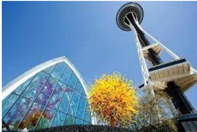
Space Needle and Chihuly Garden and Glass Campus

9:45 a.m. Group A Departs Amazon Spheres and walks to the Space Needle and Chihuly Garden and Glass Campus and explores area until 10:30 a.m.