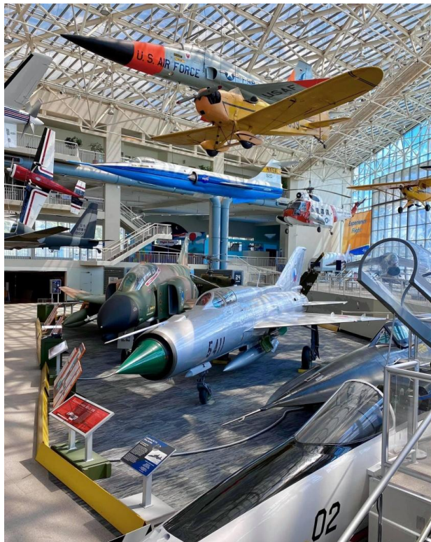
Museum of Flight

Bring your luggage if you are leaving for the airport from the Museum. Registered significant others may ride in the bus.