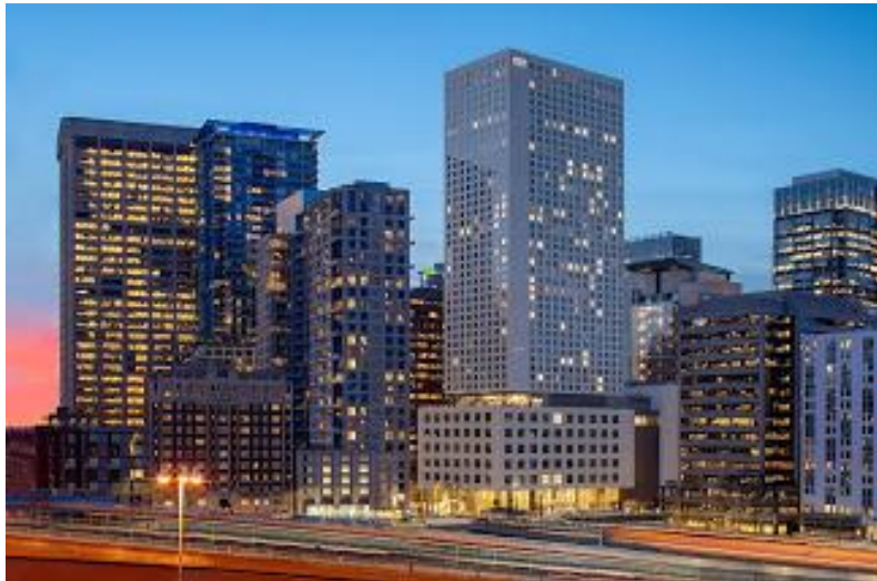
Hyatt Regency Seattle Hotel

Fly into Seattle-Tacoma Airport and take taxi, Uber, Lyft, or the Link Light Rail to the conference hotel. The most economical mode of travel to and from the airport is the Link Light Rail. If you plan to take the Light Rail, from the airport, you will purchase a ticket to the Westlake Station, which is about a 9-10 minute walk to the conference hotel.