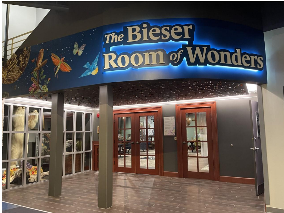
Beiser Room of Wonders, Boonshoft Museum of Discovery

The Boonshoft Museum of Discovery in Dayton has science and natural history exhibitions, including a planetarium and a small zoo. It offers numerous hands-on experiences and STEM educational programs. The Beiser Room of Wonders was recently renovated to display more artifacts in the discovery center and show why natural history museums are important. The Museum curates 1.8 million objects, predominantly archaeological specimens excavated from the SunWatch site, but also including insects and other animal specimens, rocks, minerals and fossils. The Discovery Zoo includes over 100 live animals including mammals, birds, reptiles, amphibians, and insects.