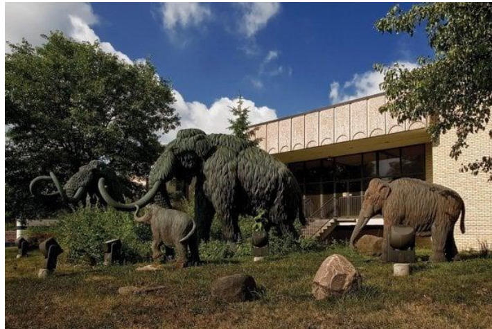
CMC Geier Collections and Research Center

Open by appointment or through one of the scheduled tours, the Geier Center houses CMC archaeology collections, invertebrate and vertebrate fossil collections, all zoology collections, history artifacts and fine arts. The facility includes laboratories for working on paleontology, archaeology and zoology collections, curatorial and registration offices, and the Science Library.