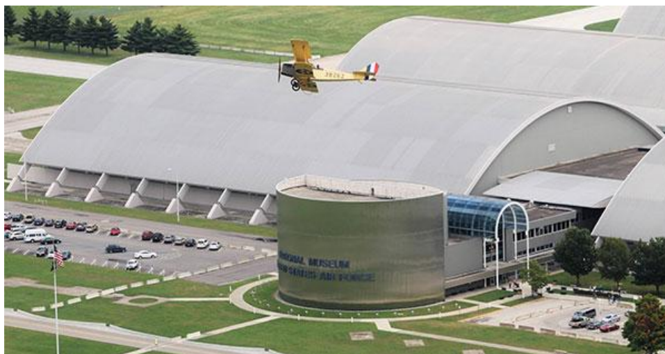
National Museum of the United States Air Force

Because we are touring on the active part of the base, ASMD participants who are U.S. Citizens will need to bring a current State issued Drivers license or ID card. Non U.S. citizens will need to provide specific passport information at least two weeks prior to the tour and have their passports with them on the tour.