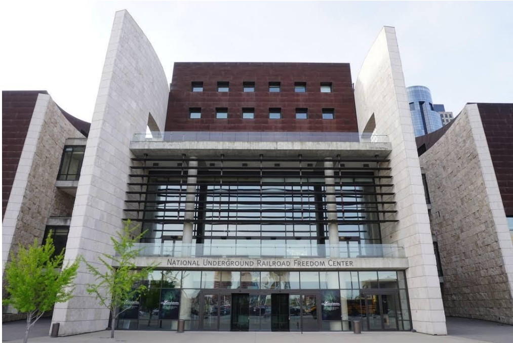
National Underground Railroad Freedom Center