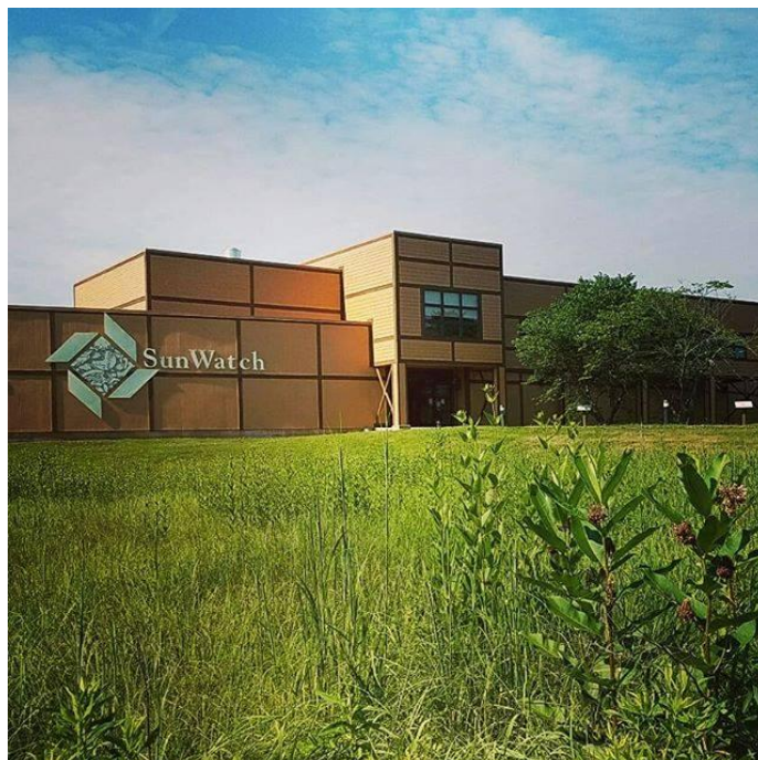
SunWatch Interpretive Center

SunWatch is part of the Dayton Society of Natural History's Boonshoft Museum of Discovery. The Dayton Museum of Natural History (now known as the Boonshoft Museum of Discovery) began salvage archaeological excavations at the site in 1971 when it was threatened by the expansion of a sewage treatment plant. After 17 years of excavation and research, the site was opened to the public and now includes part of a reconstructed village, an interpretive center, and picnic facilities. Native Americans occupied the village during the Fort Ancient period (ca. A.D. 1400). The Dayton Society of Natural History recently received a National Endowment for the Humanities matching grant to support capital improvements for the interpretive center. We will have lunch at noon and programming in the interpretive center and tour the reconstructed village.