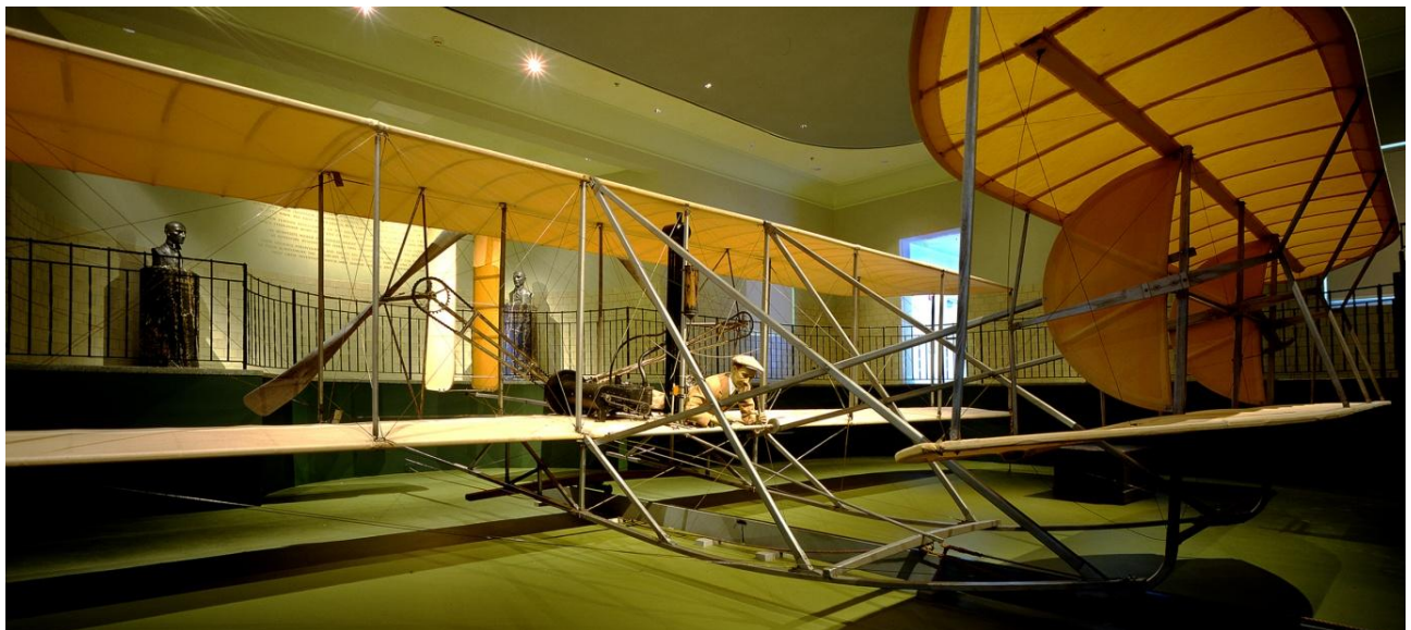
Wright Brothers National Museum