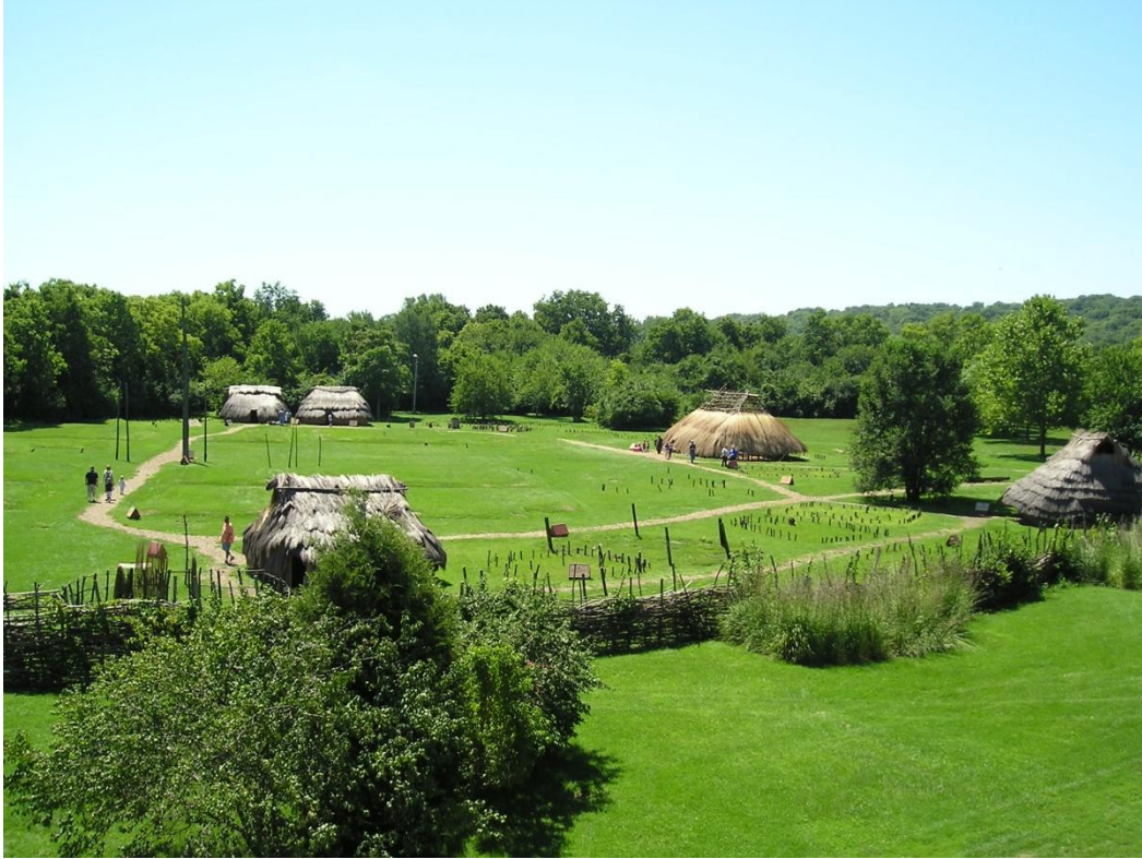
SunWatch Reconstructed Village

1:30-2:30 p.m. Self-guided Tour of SunWatch Reconstructed Village. Program presenters will join the group.