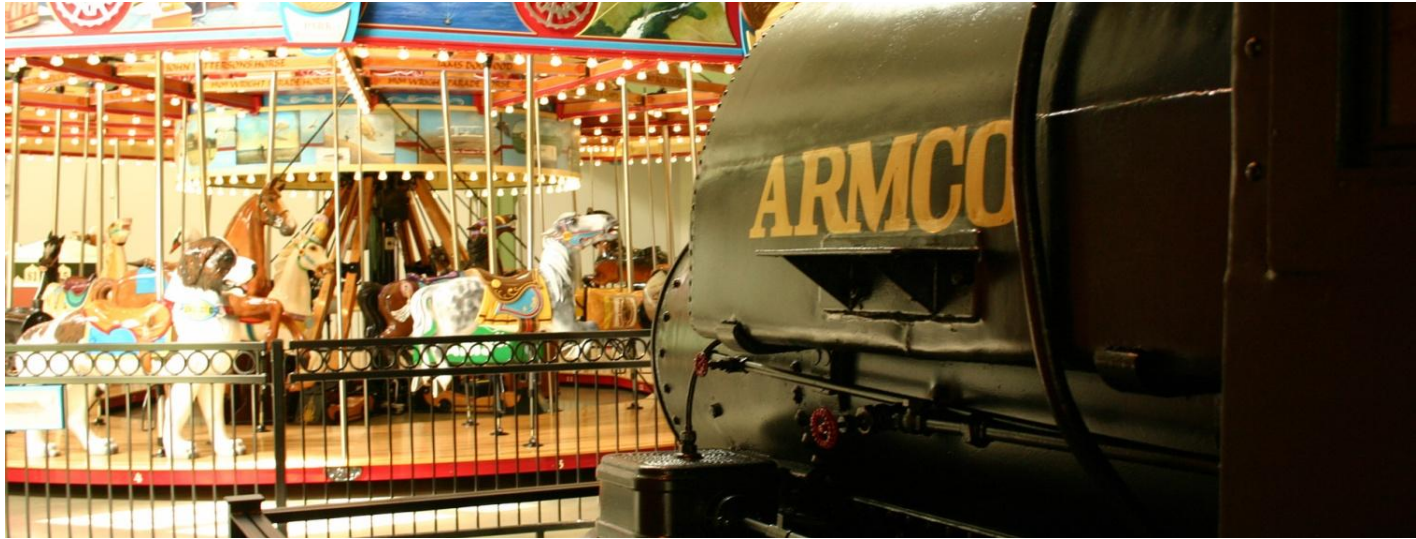
Heritage Center of Manufacturing and Entrepreneurship

7:00-8:30 p.m. Dinner at Carillon Brewing Company in Carillon Park, the nation's only fully operational production brewery in a museum