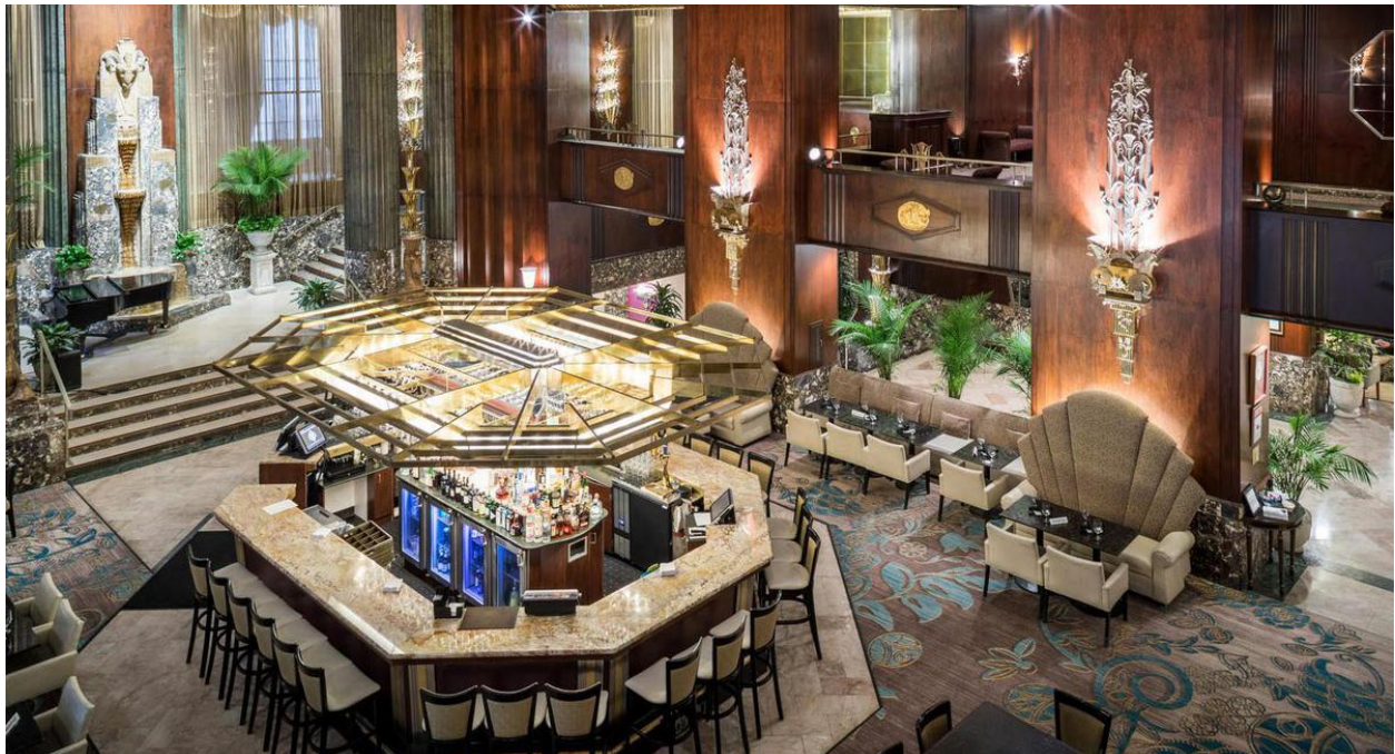
Hilton Netherland Plaza Hotel Lobby

Fly into Cincinnati/Northern Kentucky International Airport (CVG). Take cab, bus, or other transportation for the ca. half hour (13-14 mile) ride to the Conference Hotel (Hilton Netherland Plaza, 35 West Fifth Street, Cincinnati, OH 45202). This Art Deco Hotel (image below) has National Historic Landmark Status. The room rate is $129 per night. This rate is available from January 29 through February 4 for those who choose to come up to two days before and/or two days after the meeting. Guests must identify their affiliation with ASMD at the time of the reservation and reservations must be made prior to the January 10, 2023 cutoff date. Reservation may be made directly with the hotel at 513-421-9100 or by using the custom reservation link provided here: https://group.hilton.com/ae5pki . If using the custom link, select the first night of your stay and edit the interval for your whole stay. As noted above, you will get the special rate for stays longer than 3 days.