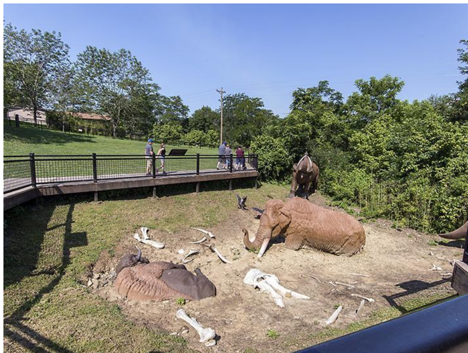
Big Bone Lick State Historic Site