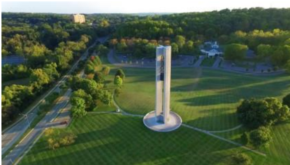
Carillon Historical Park

This well-maintained Historical Park celebrates the ways that Dayton changed the world as the home to the airplane, the automobile self-starter, the cash register, and the first nationally acclaimed African American Poet.