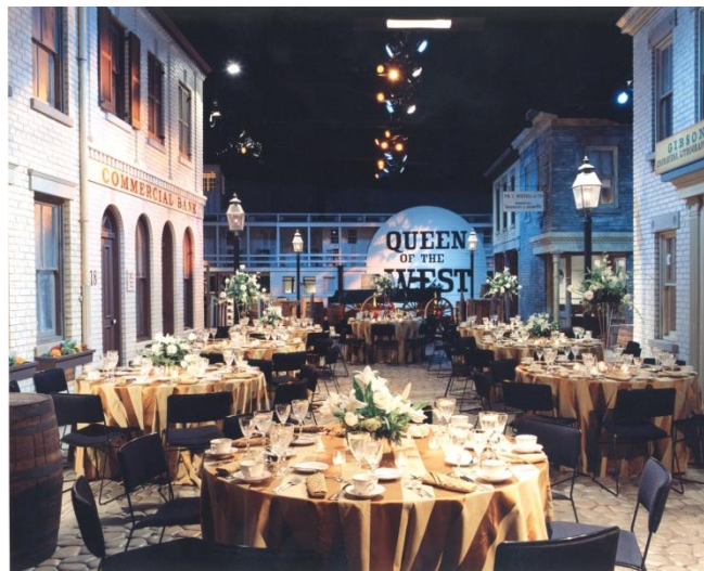
Cincinnati History Museum, Public Landing

We will assemble in the spectacular recreation of the Cincinnati Public Landing for cocktails and dinner.