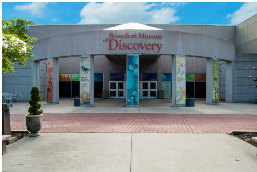
Boonshoft Museum of Discovery

3:00-5:30 p.m. Arrival and Programming at Boonshoft Museum of Discovery